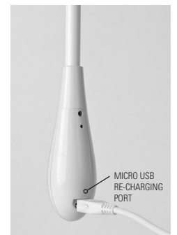
figure 2: Back of wand