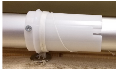
figure 4: Lift Cord on Spool